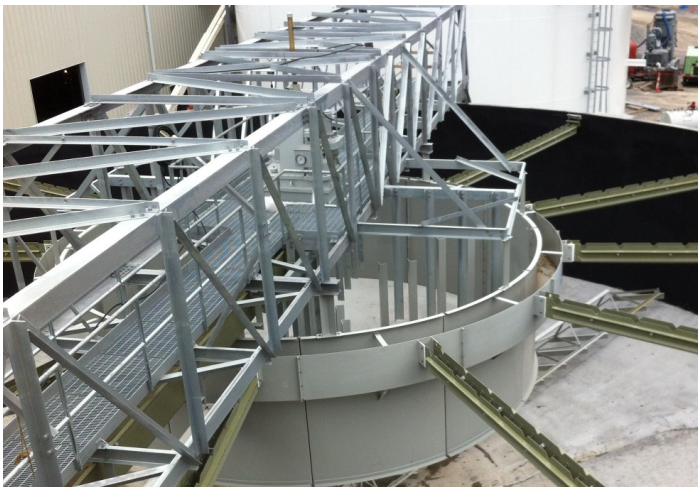
Flocculating Clarifier with Dual Drive and Lift

PRE can custom design a drive to meet your needs.