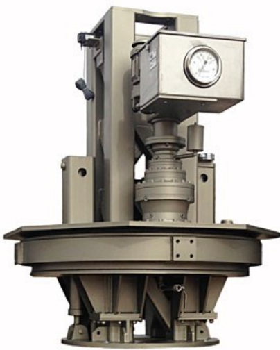
Cage Drive and Lift