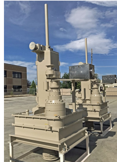
Shaft Drives and Lift

An optional 4 - 20 mA signal can be specified which may be sent to the control room for remote monitoring.